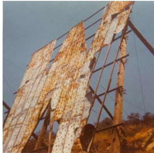
The sign in despair (1973)