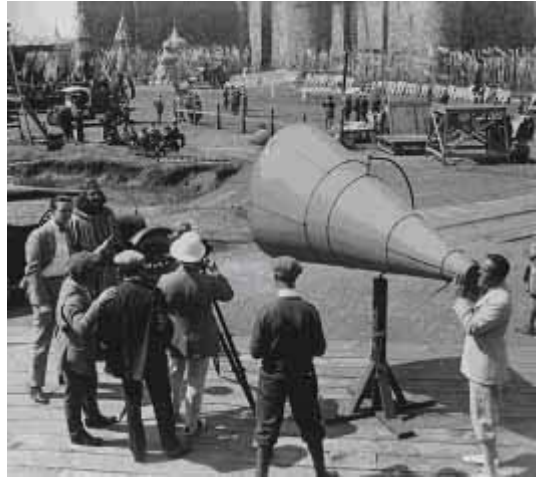
Douglas Fairbanks uses “state of the art” communication device to direct Robin Hood (1922)

It wasn’t just sunny skies that spurred the mass film migration to Hollywood. In 1897, famed inventor and early movie mogul Thomas Edison began suing rival producers who were utilizing filmmaking-projection devices based (he felt) on his Kinetoscope technology. Many of these movie ‘pirates’ fled from New Jersey (home of the Edison Company and the original movie capital), first to Cuba, then to California – for good.